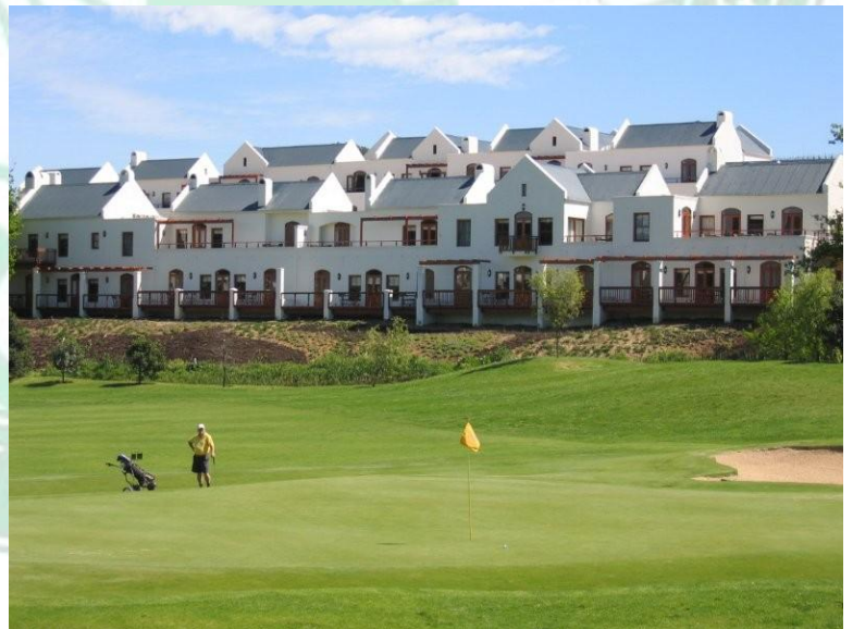
Kleine Zalze Golf Lodge