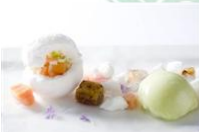
The degustation menu at Nova starts with a citric dome and finishes with an apple snowball

It's these techniques and elements you'll often find him pondering with foodies with the sort of severity others might devote to planning their will. A dish might have an assortment of tiny details - dehydrated tomato skins, micro herbs, tomato sorbet and emulsions of lettuce and microspheres. Carstens calls it isolating an ingredient by encapsulation of flavour and separating the parts, and it's effective on the palate, even if confusing for the eyes and head. The upside is you'll leave the restaurant without feeling weighed down by food, despite eating seven courses. So consider that before you write off a menu beginning with a nitrogen-frozen citric dome with melon seed milk and caramelised caviar, and finishing with an apple snowball.